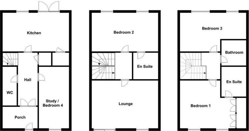
This floor plan is not to scale and is for illustrative purposes only. We make no guarantee, warranty or representation as to its accuracy and completeness.